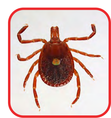
LONE STAR TICK