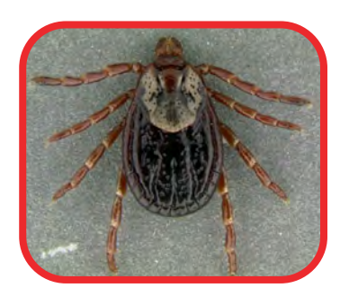
AMERICAN DOG TICK