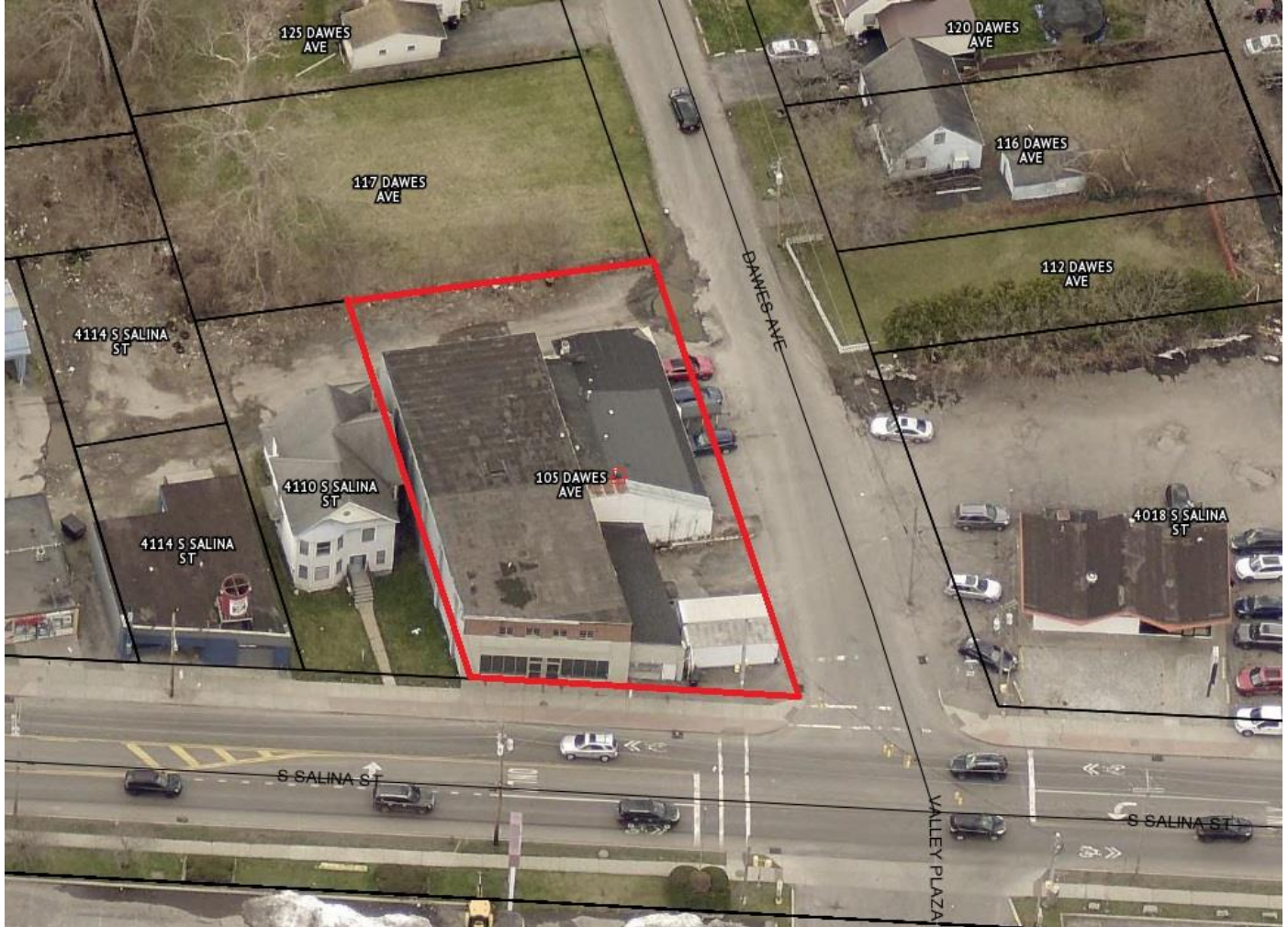
Figure 2: Aerial Imagery of Subject Property

Description: Figure 2 shows satellite imagery of the subject property.