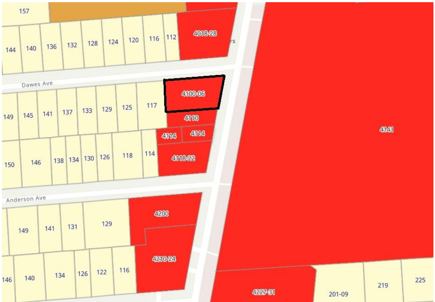
Figure 1: Zone District of Subject Property

Description: Figure 1 shows the current Zone District of the subject property.