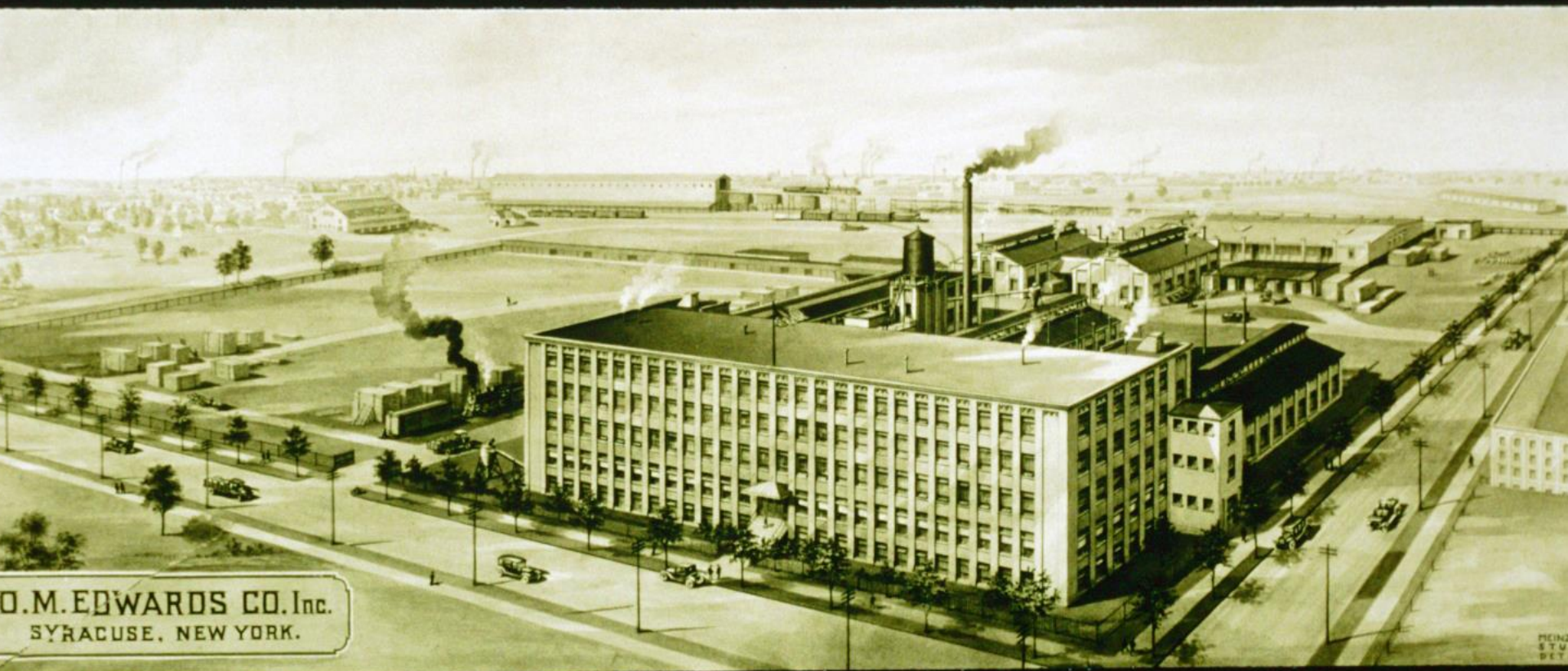
O.M. EDWARDS CO. Inc. SYRACUSE, NEW YORK.