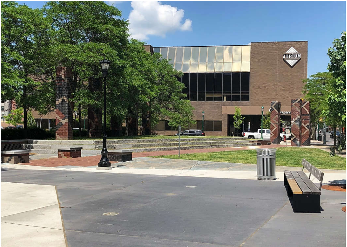
View NE: Veiw from new Salina Plaza area