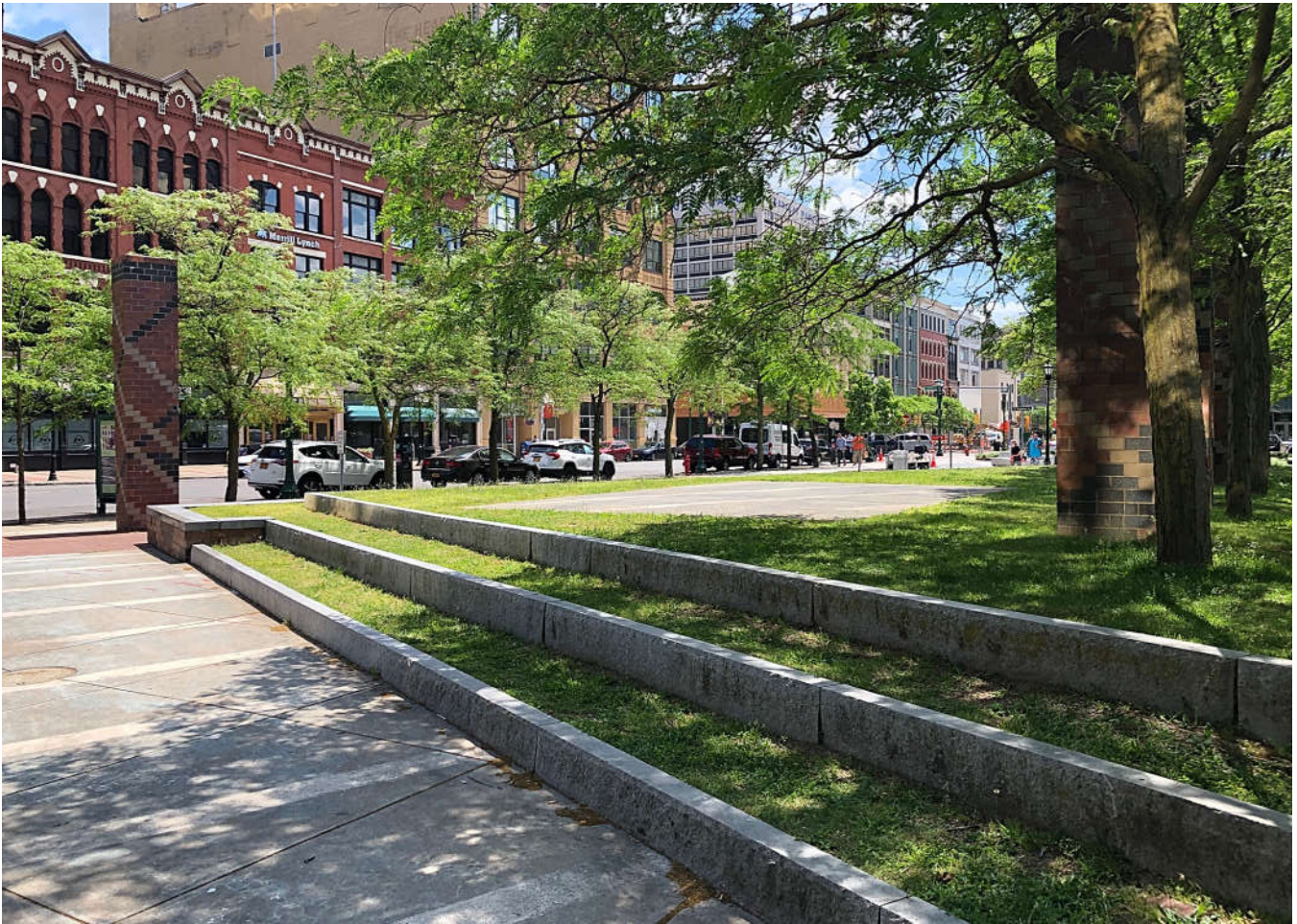
View SE: View of platform area