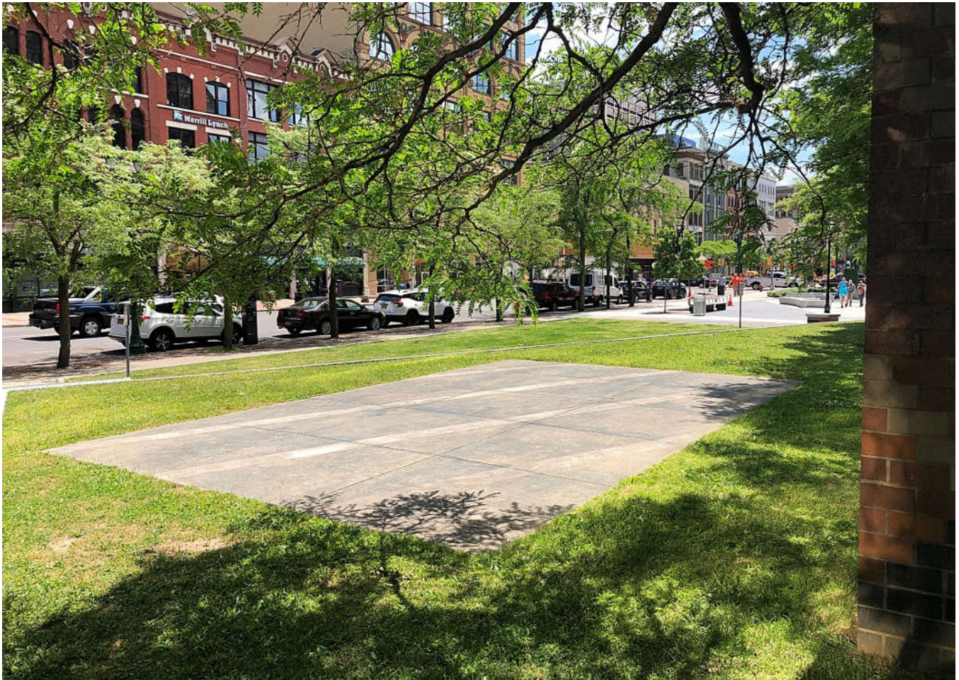
View SE: Detail of concrete pad