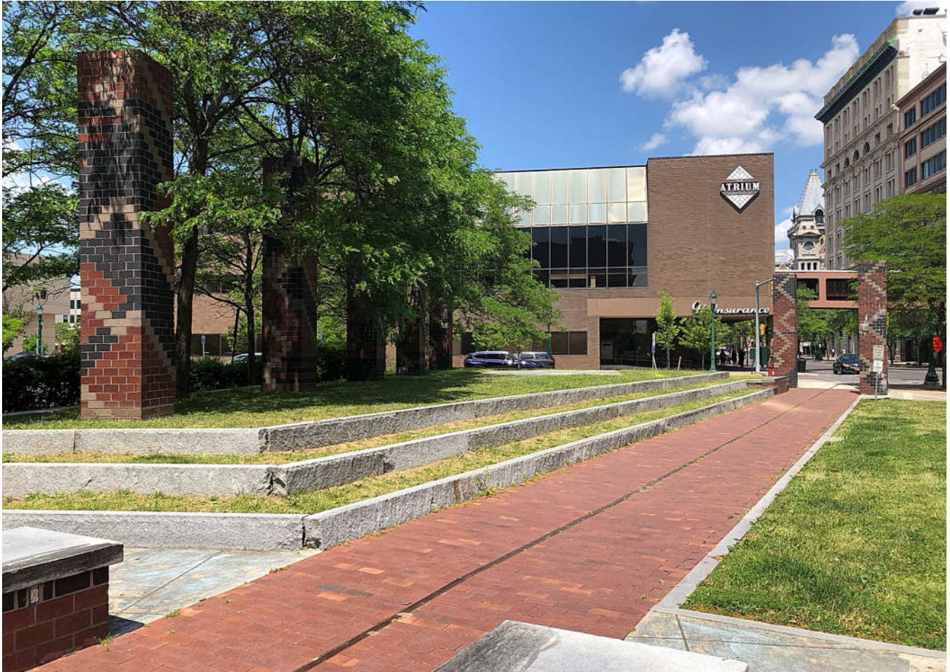
View NW: Closer detail of platform area