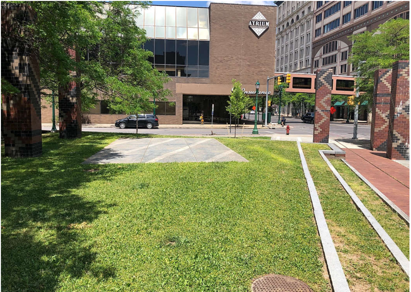
View N: Detail of concrete pad