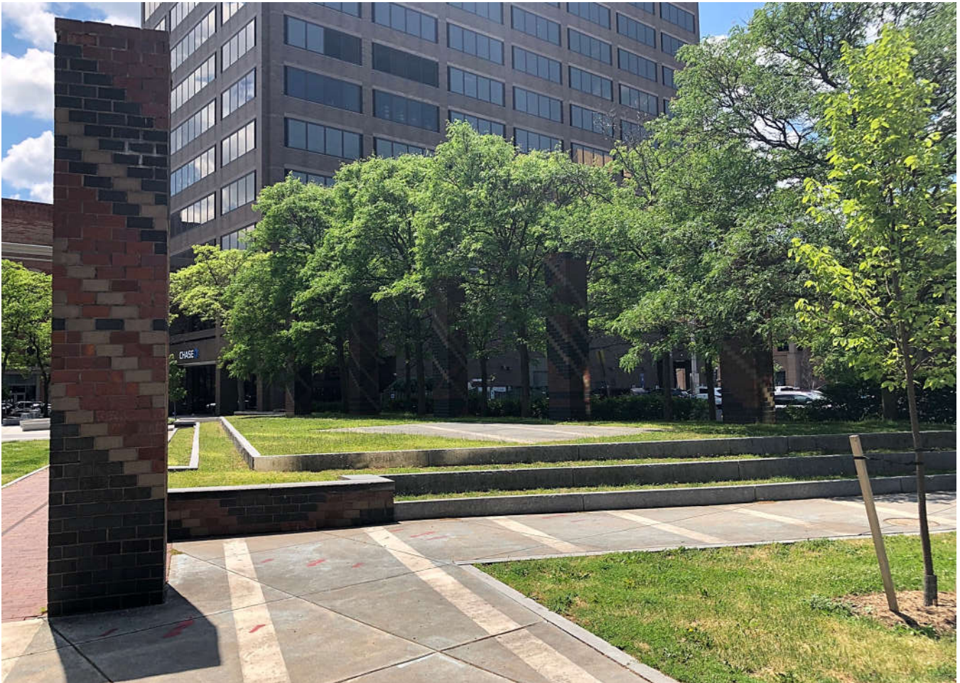
View SW: View of platform area