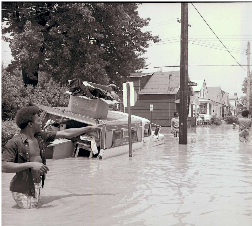
Above Photo – July 1974 flooding from Onondaga Creek at Sterling and Hudson Streets near the Midland Avenue Bridge which caused the evacuation of residents from several blocks in the vicinity. This location is 500 feet from the stream channel.