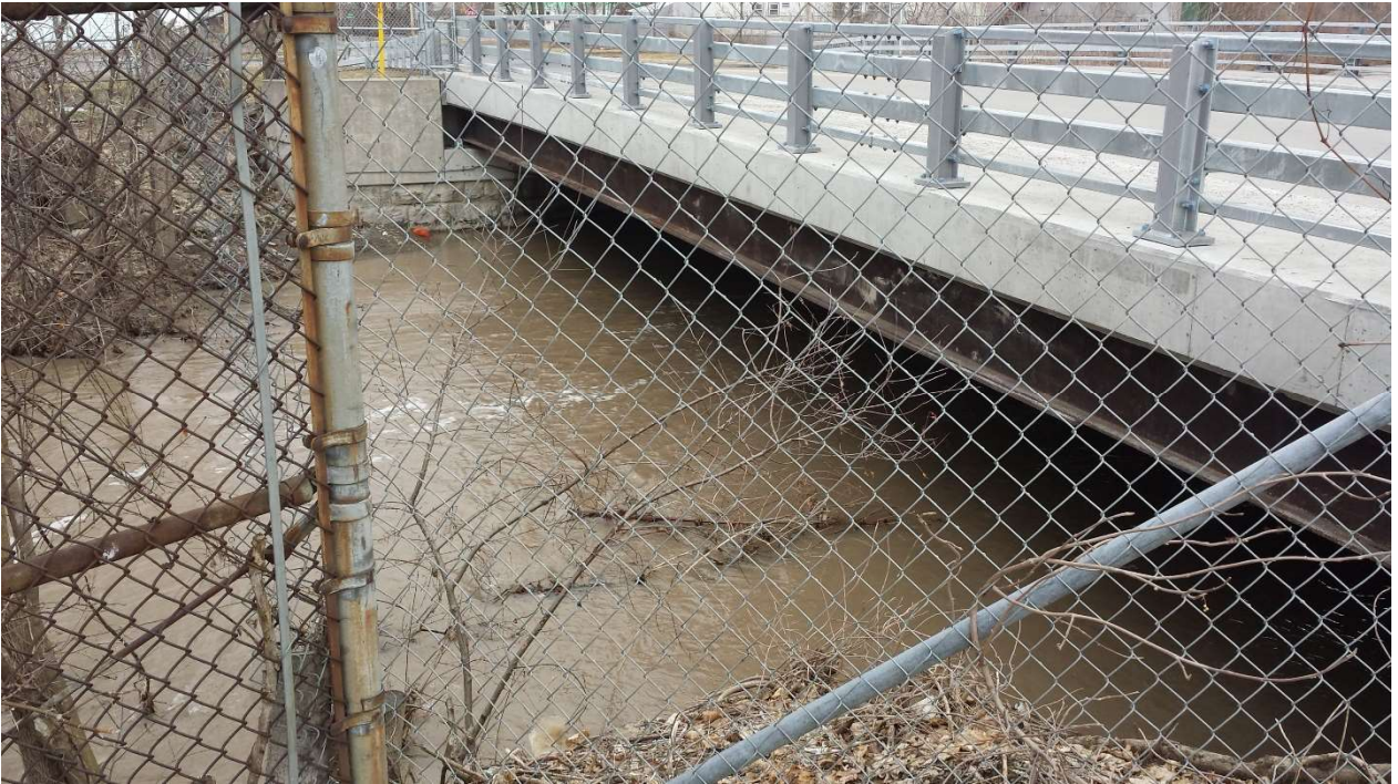
Above Photo – High flow and velocity at the Midland Avenue Bridge. The measured flow was only one-third of the estimated FEMA 100-Year flood flow, but came within two feet of the bottom of the bridge. If the water elevation had reached the bottom of the bridge, upstream flooding would likely have occurred. Flooding starts to occur on parts of Onondaga Creek within the City at approximately one-half of the FEMA estimated 100-Year flood flow.