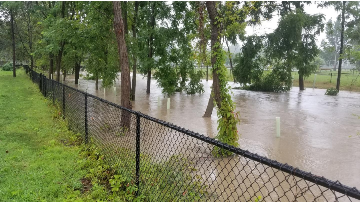
Figure 2 – August 19, 2021- High flow and water levels on Onondaga Creek at Kirk Park. Water levels were at their highest in over 10 years.

Even with these flood reduction measures, flood risks remain a real threat for people and property along these streams. In both August and October of 2021 water levels and flows reached their highest levels in more than 10 years on Onondaga Creek, flooding into Kirk Park and Lower Onondaga Park, as well as nearby backyards on Cheney Street.