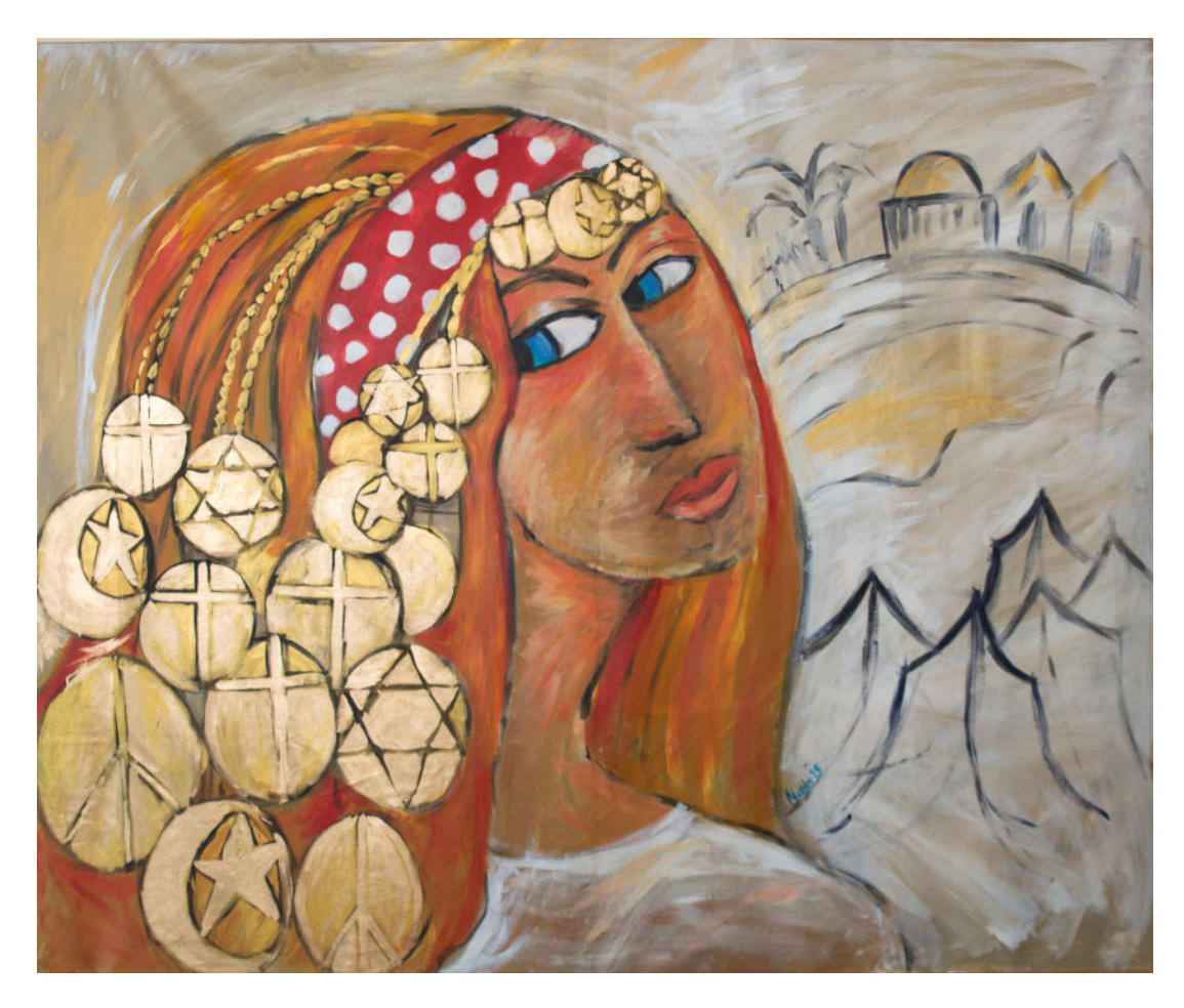
I am Syria