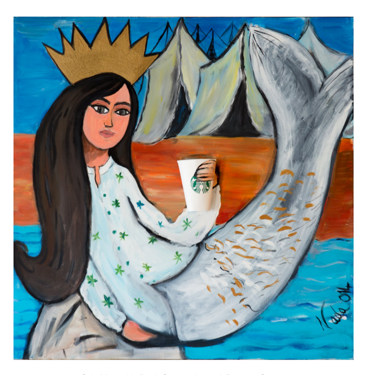
Only Mermaids Drink Cappuccino in A Refugee Camp