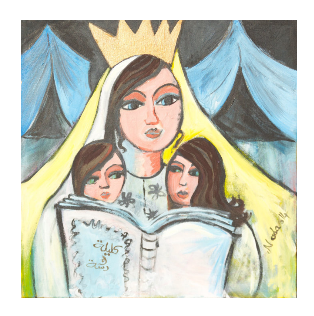
Bed Time Story