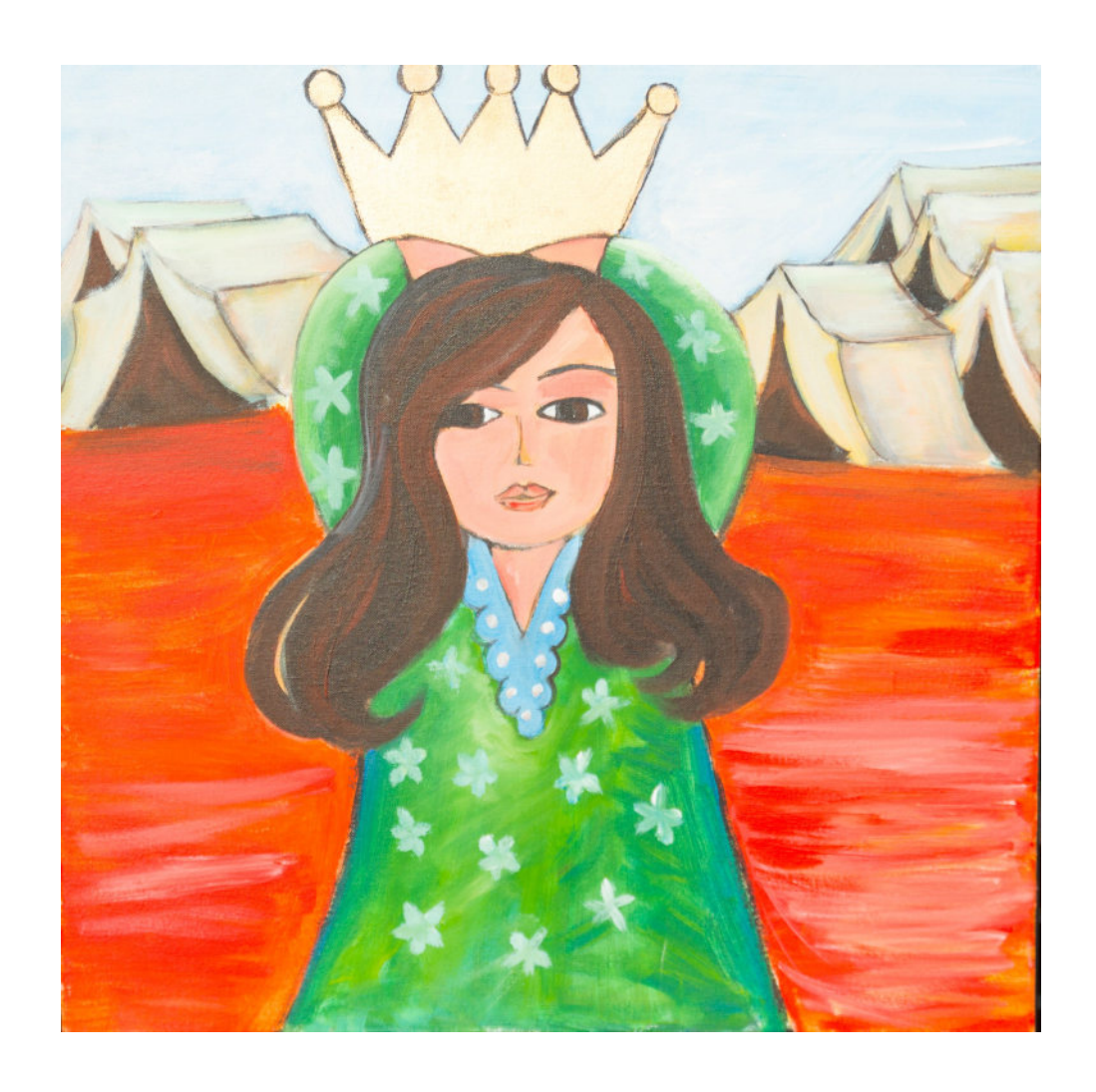
I am a Princess