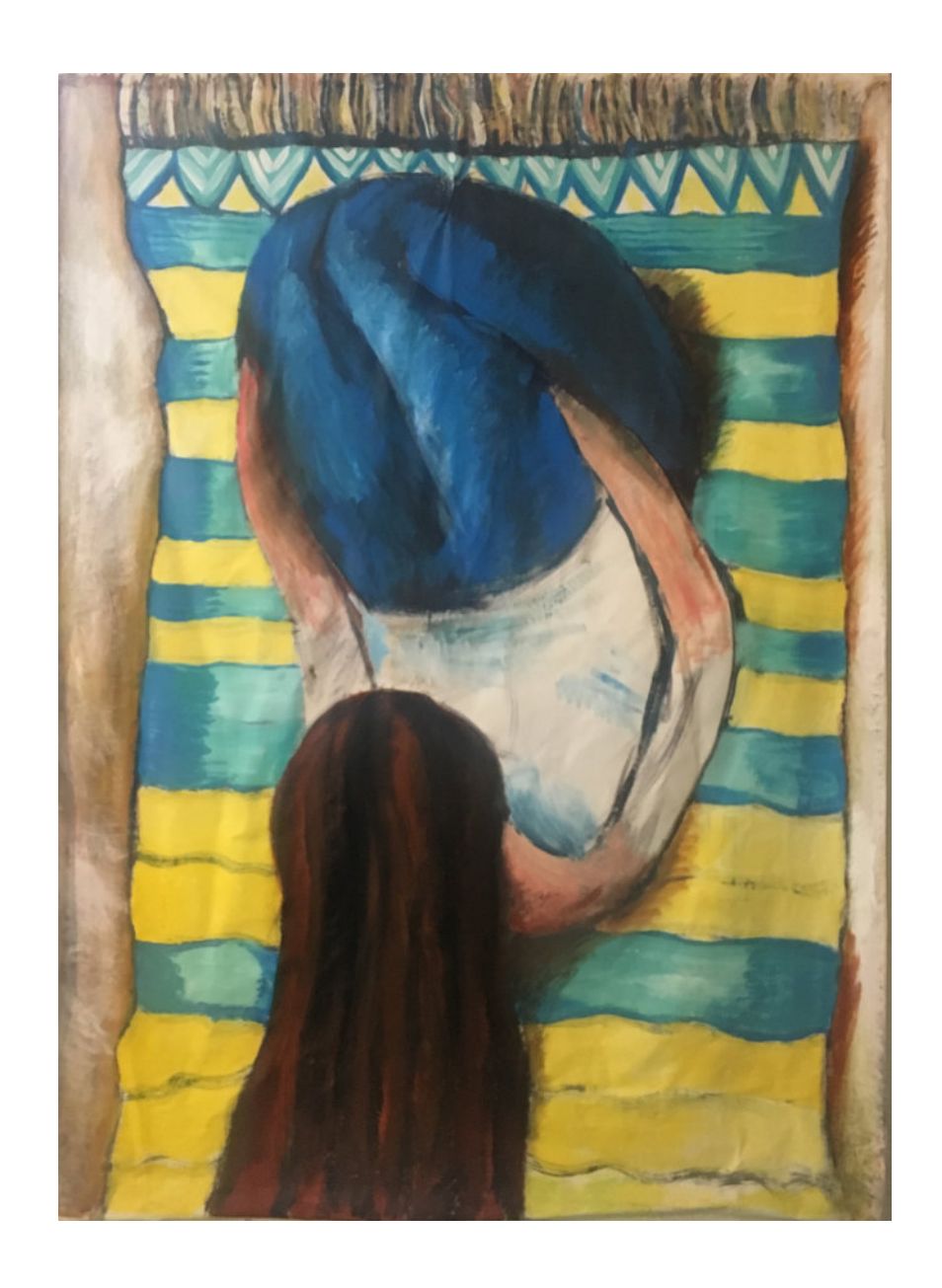
In My Mother's Womb