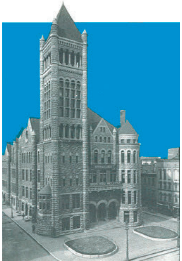
CITY OF SYRACUSE + ADAPT CNY

Integral to the redesigned space will be a large ground mural that will occupy the former driveway and parking area.