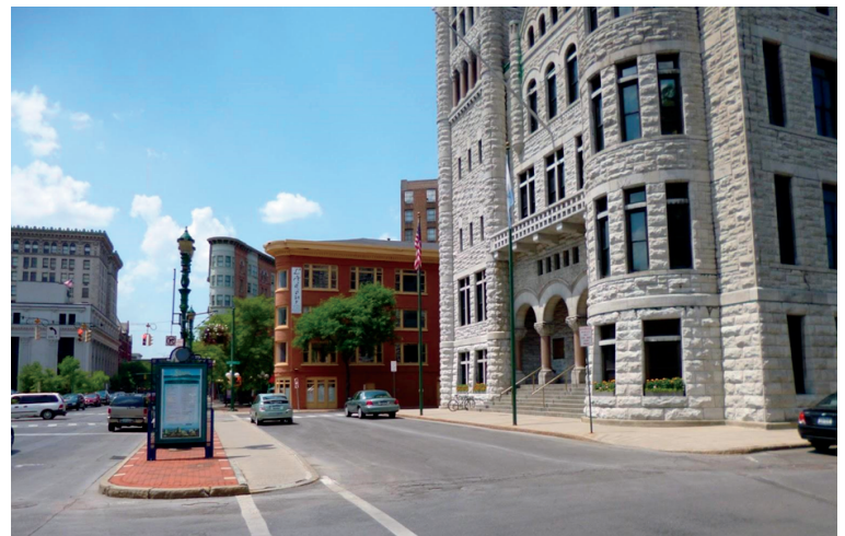
Syracuse City Hall plaza, current condition

Located at 233 E. Washington Street, the site is rectangular and measures approximately 26' x 90' or approximately 2300 square feet. It is bounded to the north and south by low curbs and will be bounded to the east and west by permanent planters. The surface material is asphalt, which will be repaired and sealed prior to the installation of the mural.