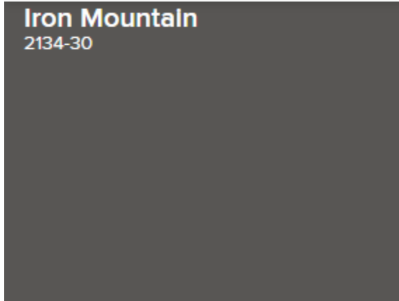
Second floor shingles (house) and trim (house and garage)