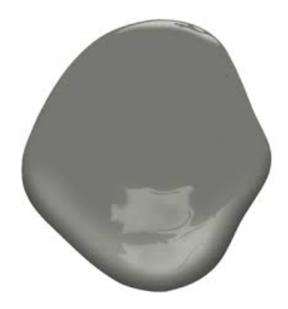
Benjamin Moore Amherst Gray HC-167 (body)