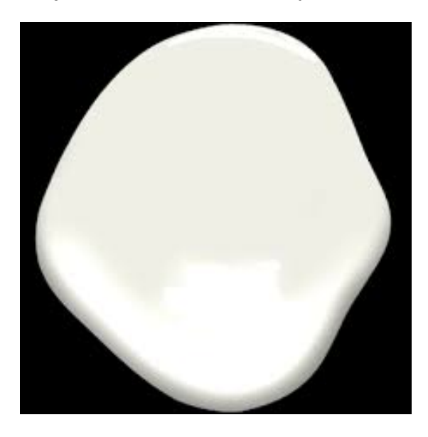
Benjamin Moore White Dove OC-17 (trim, windows, and other doors)